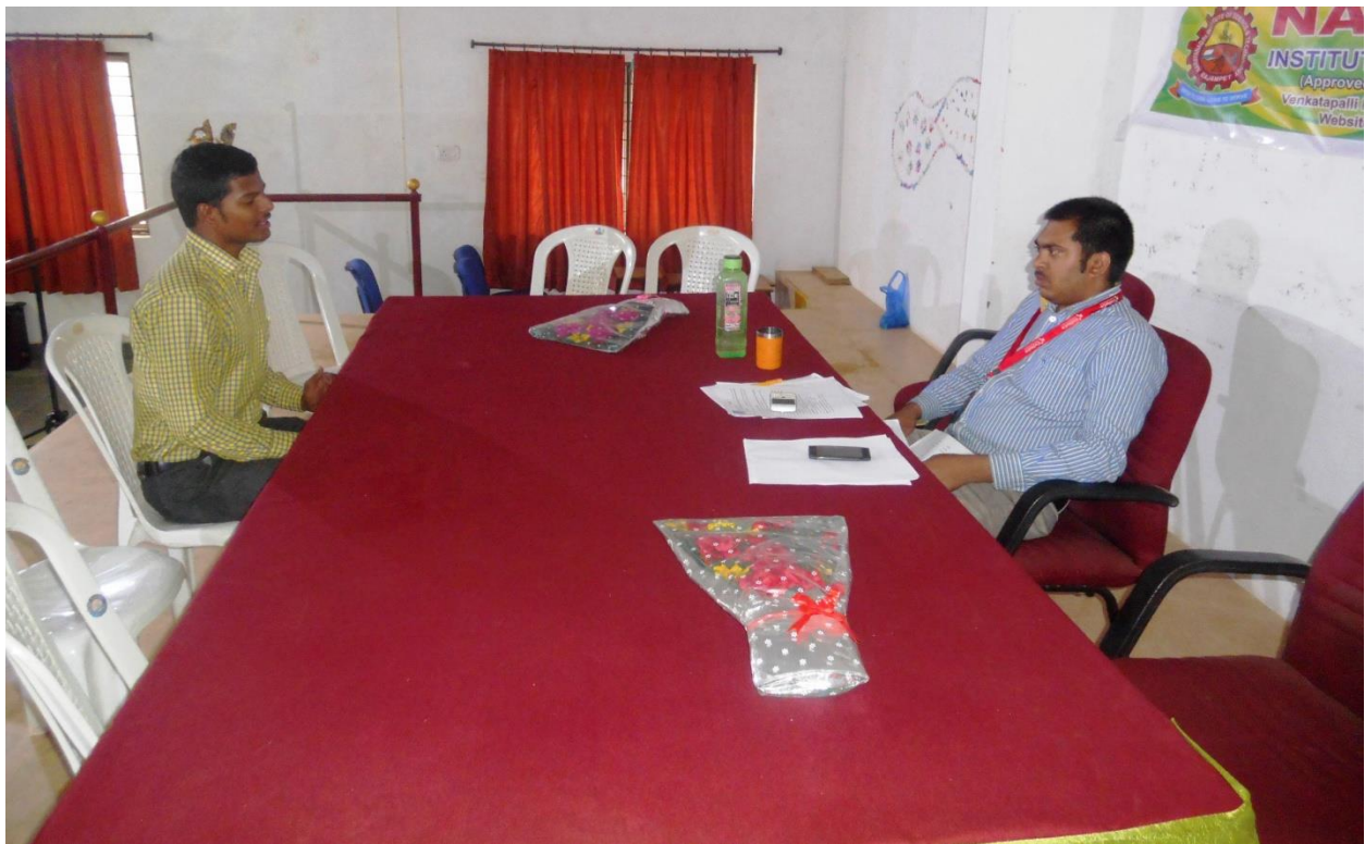
Congratulations to the students selected for Artech.